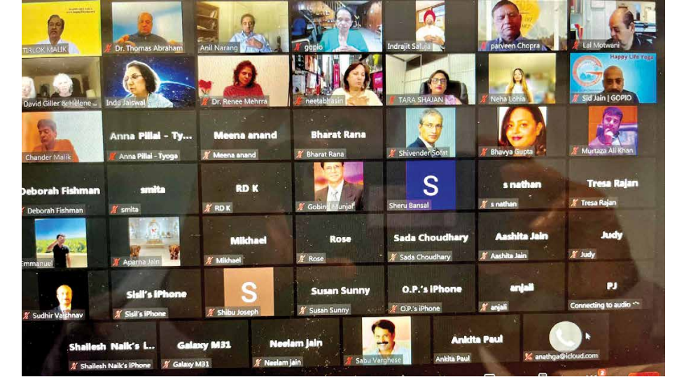
Audience at the Yoga Day on Zoom Celebration